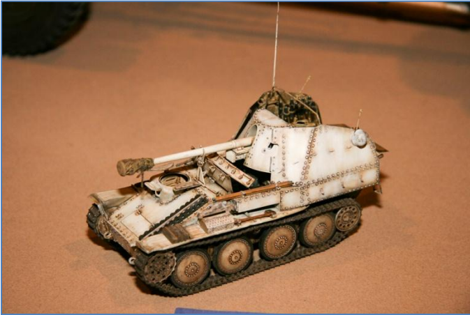
Model of the Year- Land/Sea