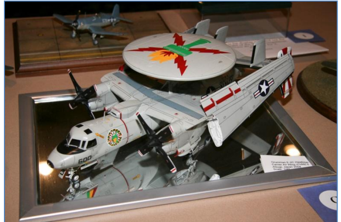
Model of the Year - Air